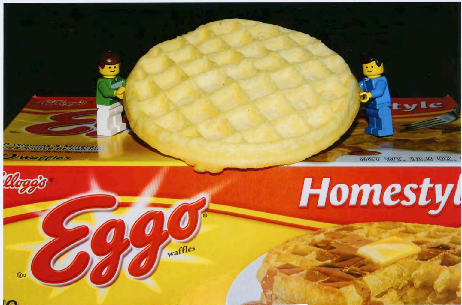
13. Cody Douglas