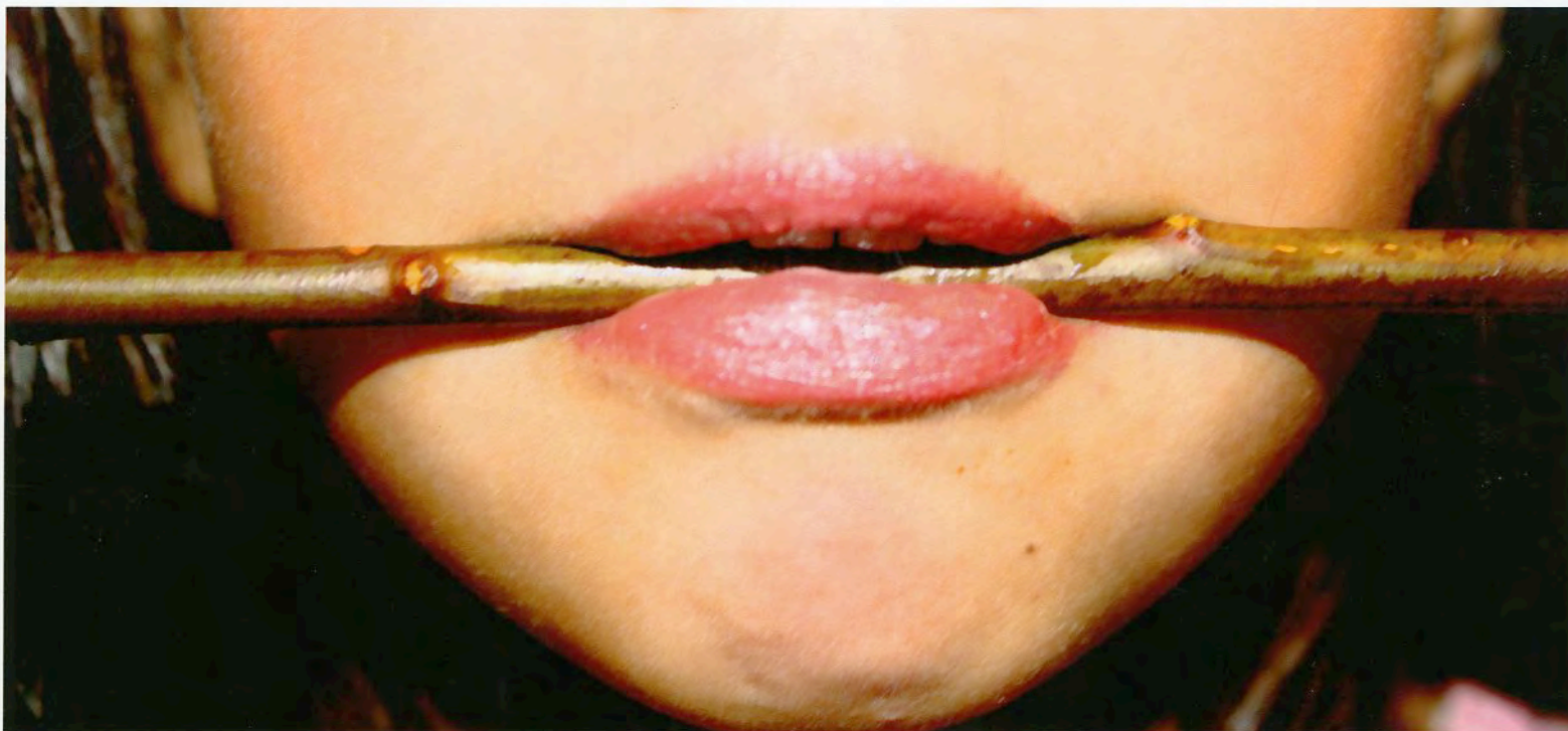
16. Lidia Perez