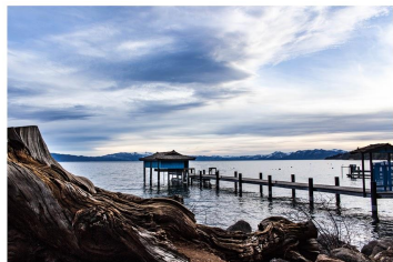
Calm Before the Storm.jpg