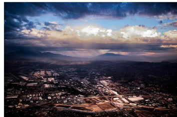
Shadows Over Vegas.jpg