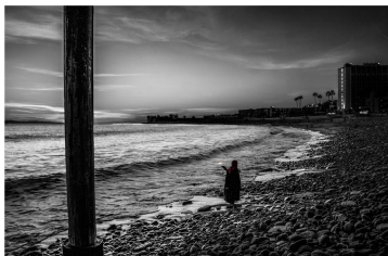
A Sunset Without Color.jpg