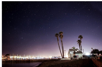
Silver Strand Stars.jpg