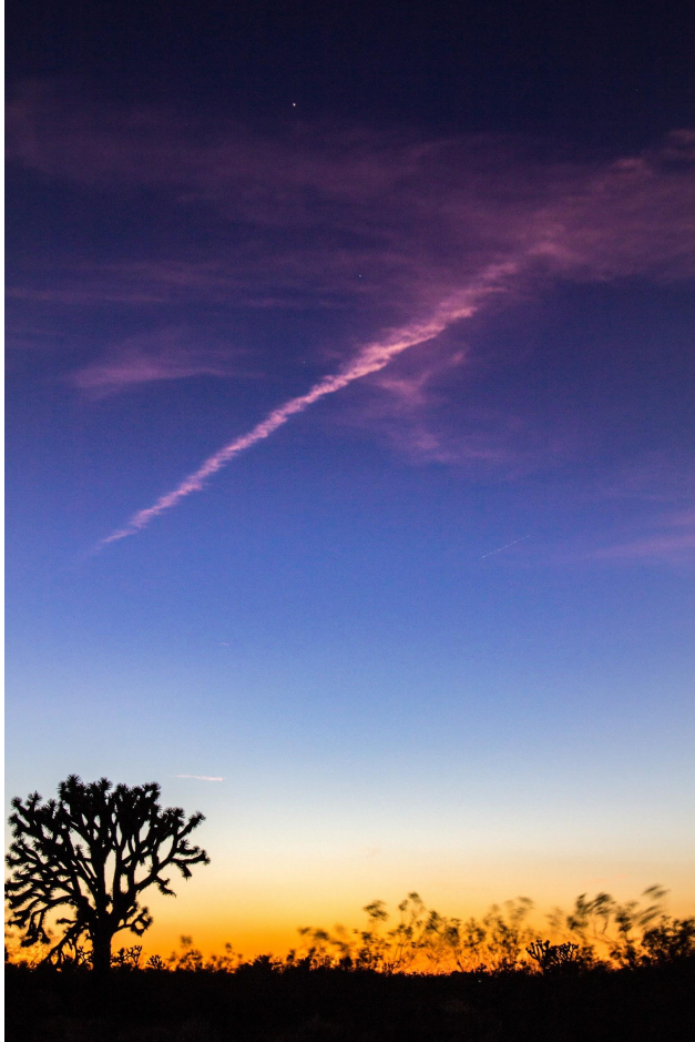
Joshua Tree Photograph 18x12 in

I placed this in the middle of my collection to represent a moment of innocence. Unlike the rest of the photos, the ground beneath remains untouched while the sky is tainted with a contrail. I chose to make it horizontal to stand out from the other images, capture the ombre element to the sky, and mirror the upright tree. In addition, this contrasts “Shadows Over Vegas” as these two images were taken in the desert but reflect two different lifestyles. Often the desert is so widely available that people seek the fun that Vegas offers. Here lies an opportunity to connect with nature and appreciate its vibrancy which is contrasted by the dark outline of the joshua tree, a key symbol in understanding the location of the image.