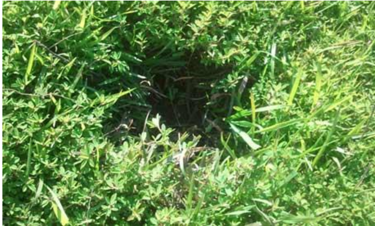
Pothole in the grass